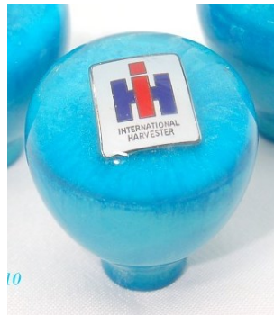
Knob #14 Pearl Blue Base, Pearl Blue Base,