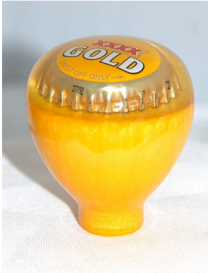
Knob #10 Pearl Yellow Base