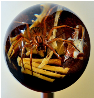
Knob #38 Black base, Spider, Bones soil, skulls