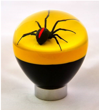
Knob #4 Plain Black Base, Plain Yellow top