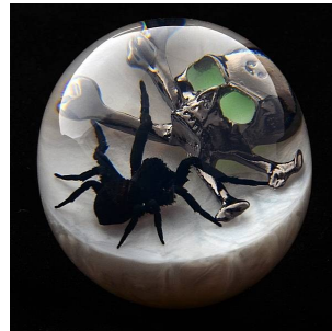
Knob #39 Pearl White Base & top, metal skull, glowing eyes.