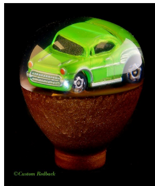
Knob #17 Antique Bronze Base