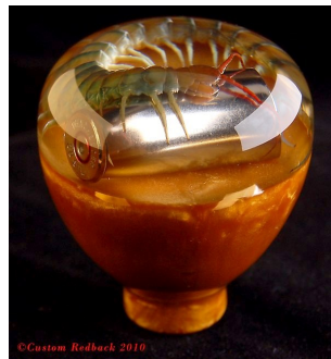
Knob #23 Pearl Antique Bronze Base