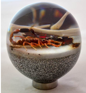
Knob #19 Sparkling Metallic Silver base, Desert Scorpion and bones, white top