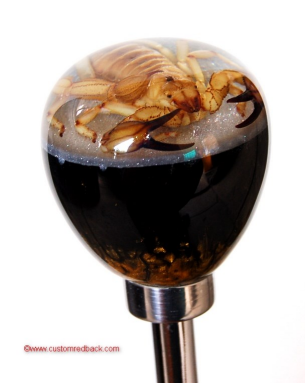
Knob #37 Antique Bronze/ Black base, Sparkling white top, Scorpion