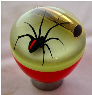
Knob #13 Plain Red Base, Glow Top