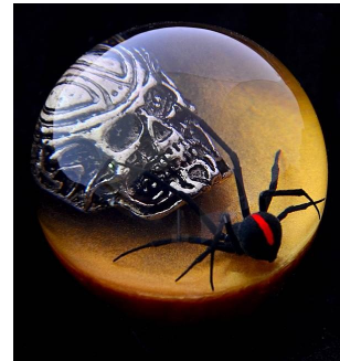
Knob #12 Aztec gold with skull