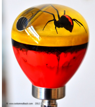
Knob #28 Black/Red Bleed Base, Pearl Yellow Top, gun shell