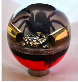
Knob #20 Black/Red Bleed Base, Pearlised top, guns shells, bling