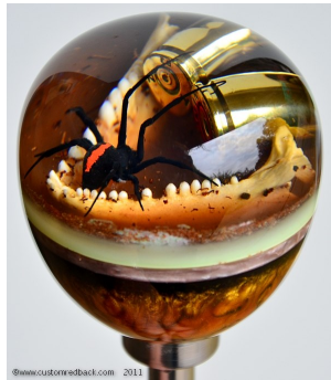
Knob #31 Pearl Antique Bronze/ Black Base Bleed, Glow Layer, reptile jaw, shells.