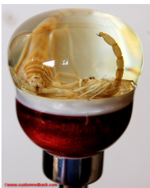
Knob #33 Fighting Scorpions, red russet base, pearl white top