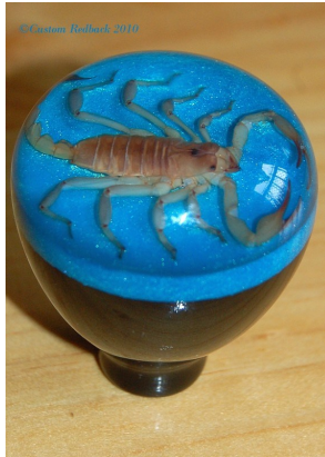
Knob #5 Plain Black Base, Pearl Blue top