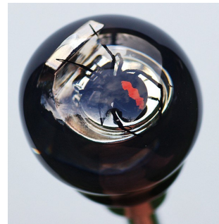
Knob #32 Black Base, Redback on the toilet seat