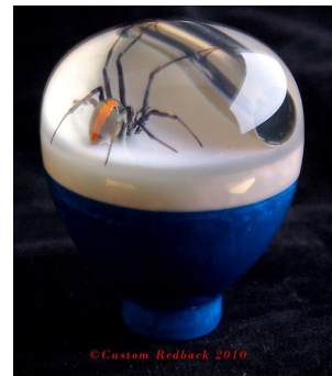
Knob #24 Pearl Blue Base, Pearl White top