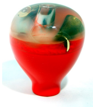
Knob #8 Plain Red Base, Glow top