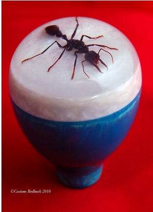
Knob #1 Pearl Blue Base, Pearl White top