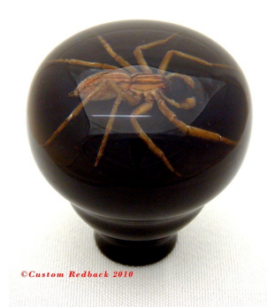
Knob #21 Plain Black Base, Shaped knob