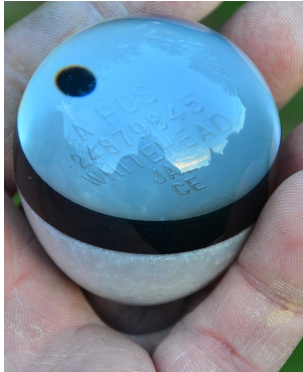
Knob #27 Dog tags, White Base, Black top