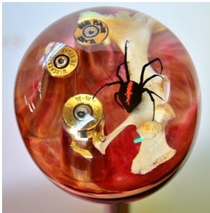
Knob #30 Pearl Russet Red Bleed Base, Bones and Gun Shells