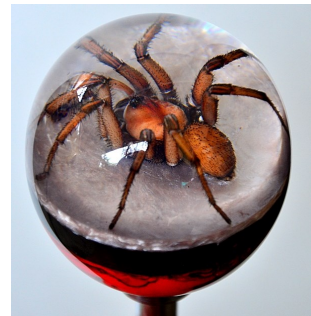
Knob #40 Black/Red Bleed Base, White Top, Trapdoor Spider