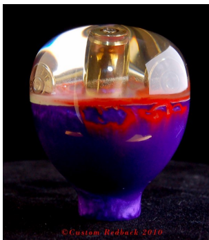
Knob #25 Pearl Violet Base, Glow top with Red bleed