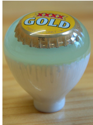
Knob #6 Pearl White Base, Glow top