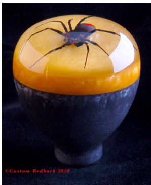
Knob #22 Pearl Antique Silver Base, Pearl Brilliant Yellow top