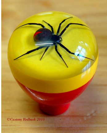
Knob #2 Plain Red Base, Plain Yellow top