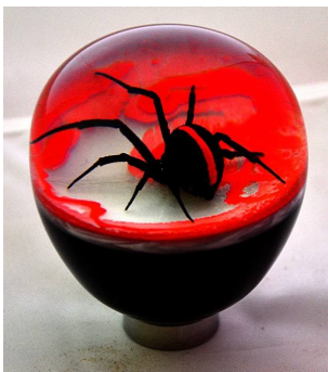
Knob #7 Plain Black Base, White top Red Bleed