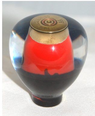
Knob #11 Plain Black Base