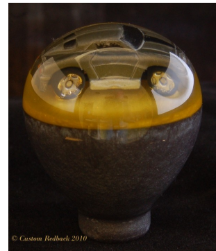
Knob #15 Pearl Antique Silver Base, Pearl Gold top