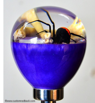
Knob #29 Pearl Blue base and top, bones, spider