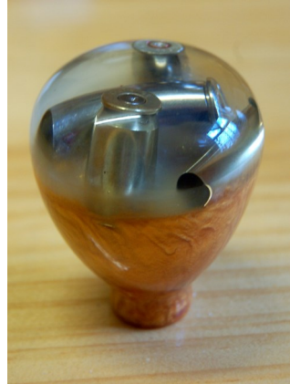
Knob #3 Pearl Antique Bronze Base, Glow top