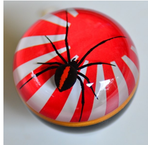
Knob #36 Yellow Base, Rising Sun disc on top—was a customer request