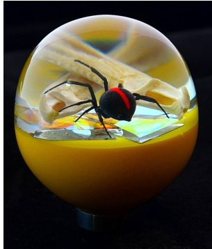
Knob #35 Plain Yellow Base, Broken Mirror, bones